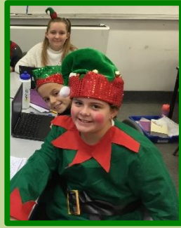
Year 3 and Y5/6 Elves.