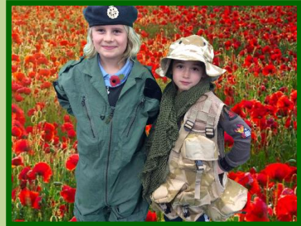
Year 3EF pupils using a Green Screen of Flander's Fields

The whole school helped to decorate the yard with poppies, posters and lanterns to share the remembrance message and at 11 o'clock, the whole school fell silent on the yard.