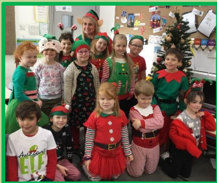
Year 2s Elves.